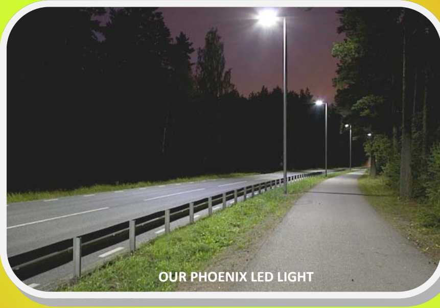
OUR PHOENIX LED LIGHT

A DIRECT COMPARISON OF OUR LED STREET LIGHTS TO AN ALTERNATIVE SUPPLIER PROVES NOTHING CAN COMPARE TO THE SPREAD OF LIGHT THAT CAN BE ACHIEVED BY INSTALLING OUR LED LIGHTS!