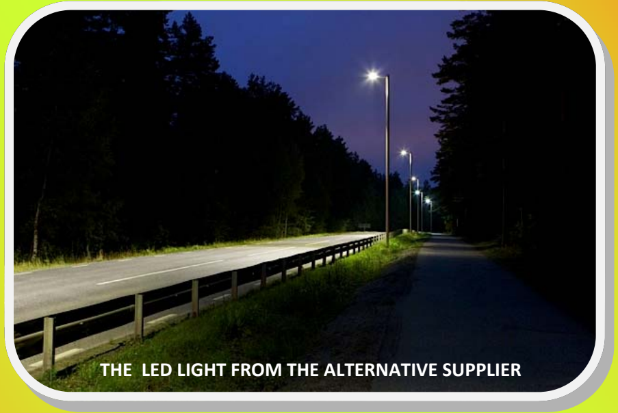
THE LED LIGHT FROM THE ALTERNATIVE SUPPLIER

Contact us for a free site survey with one of our technical team who will provide you with a full assessment of your current lighting and a calculation of return investment to enable you to make these cost-effective improvements. Give us a call now on 01258 858171 and we can arrange for an adviser to get in touch.